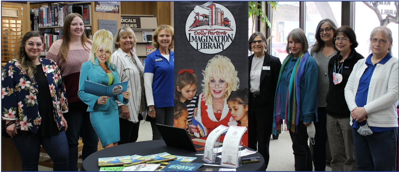
Whitman County Library Staff and United Way register children to the Imagination Library on March 2nd.

Two thousand twenty-two has been a fabulous year thus far—and it’s only April! I offer a heartfelt THANK YOU to our extraordinary Board of Directors, our dedicated community partners, and of course to you! I’m proud to report that we have raised $108,000 toward our annual campaign goal of $210,000. Your ongoing commitment to the United Way enables us to make a difference in the lives of Whitman County children, families and seniors by working to ensure that all Whitman County children 0-5 years old are ready for and able to succeed in school; bringing the Dolly Parton Imagination Library to Whitman County to put a book a month in the hands of every child from birth to 5 years old; granting funds to support the work of local organizations that provide meals to the food insecure, housing folks that need permanent and temporary shelter, educating children and youth, and counseling residents in crisis; and advocating for our ALICE families whose working in-